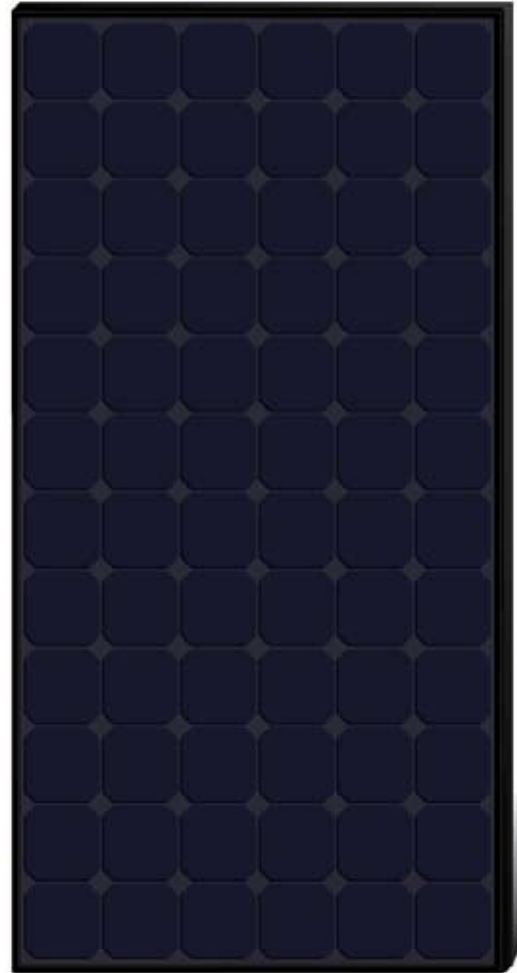
SPR-205-BLK RESIDENTIAL PV MODULE An unequalled combination of power and grace